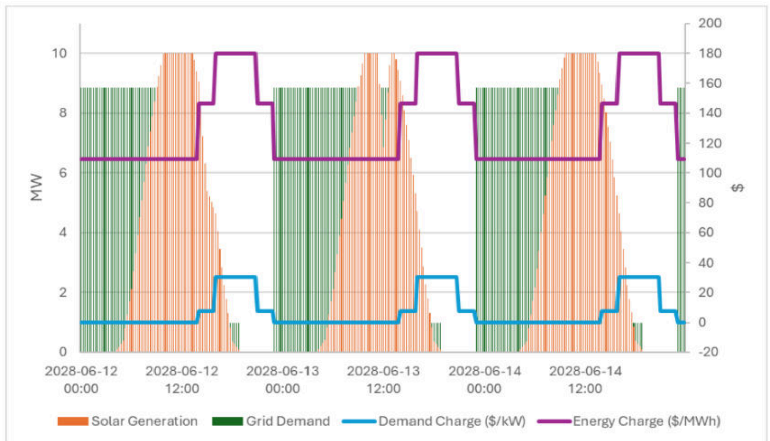
Figure 1. ToU Rate Plan: Electrolyzer hourly electricity consumption vs. energy and demand prices

Optimal operations under the Wholesale Pass-Through rate plan also show how grid electricity consumption reduces dramatically during high price hours. However, because this rate plan ties energy rates to wholesale locational marginal prices (LMP) prices, the flexibility of PEM electrolyzers becomes even more valuable and higher production is achieved throughout the day.